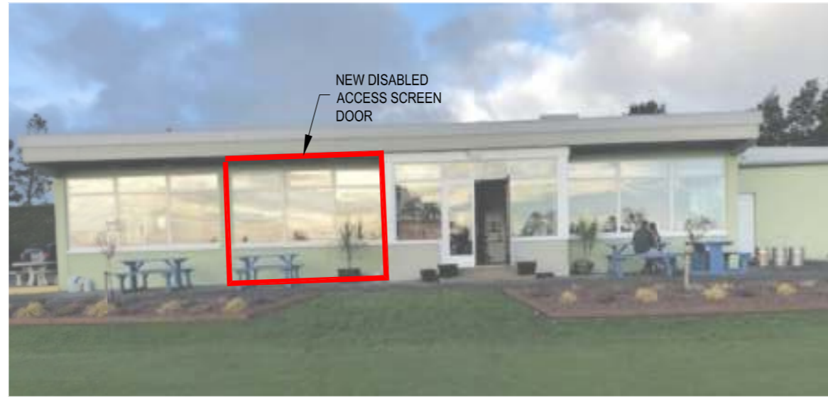
Proposed New Screen Door Location