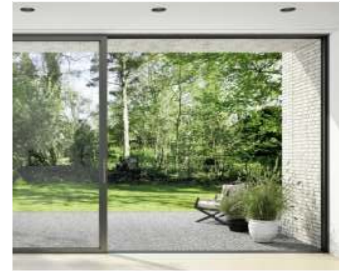
Proposed New Screen Door Example