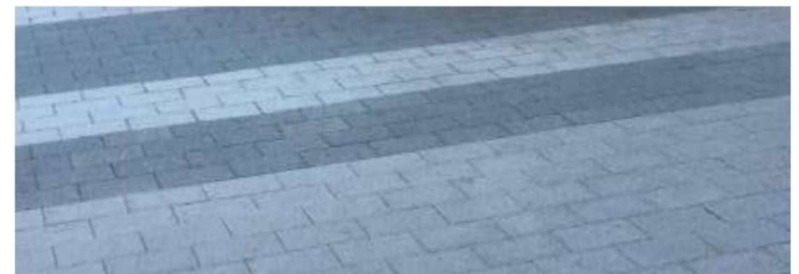
Proposed New Brick Paving Example